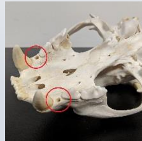
Upper Premolar 2 (UPM2)