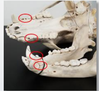
Premolar 1 (PM1)