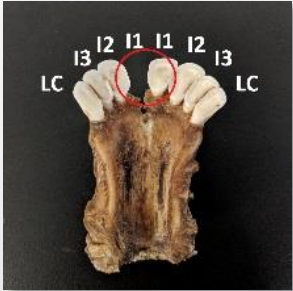
Primary Incisor (I1)