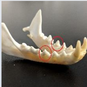
Lower Premolar 4 (LPM4)