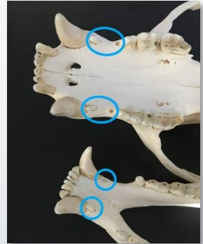
Premolar 1 (PM1)