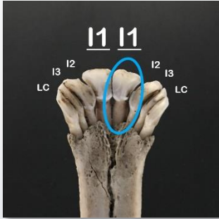
Primary Incisor (I1)